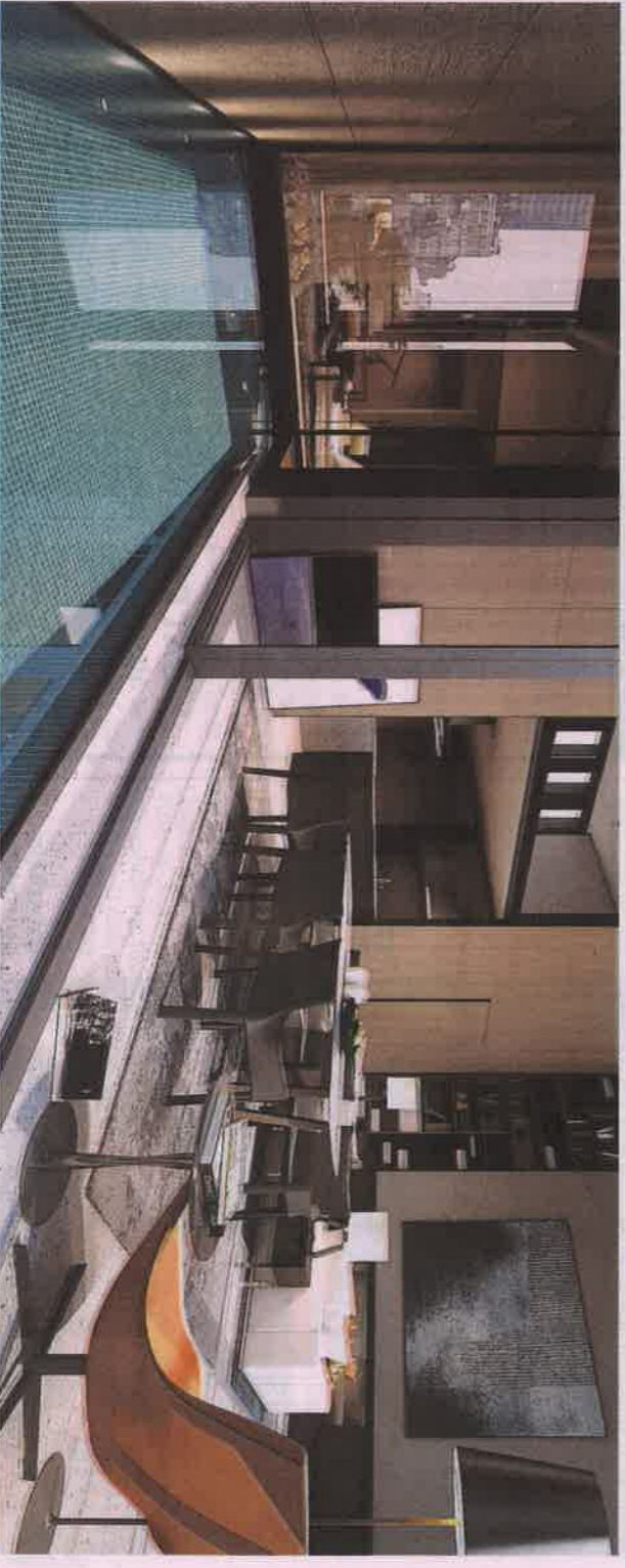
KEEPING IT TOGETHER One of the biggest concerns with private plunge pools in high-rises is leakage. At the 11-story Soori High Line in New York, rendered here, all the pools will be filled with water and left for a month to detect any leaks.