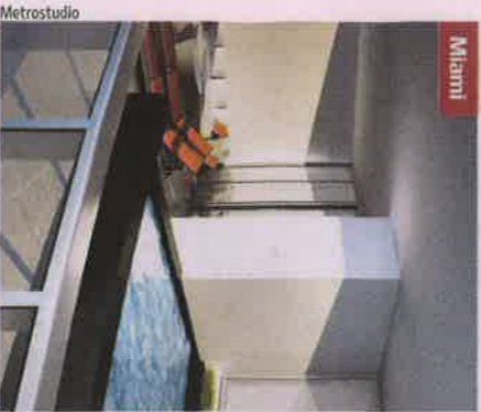
TESTING THE WATERS A rendering of Miami's Porsche Design Tower, most of the units will have pools.