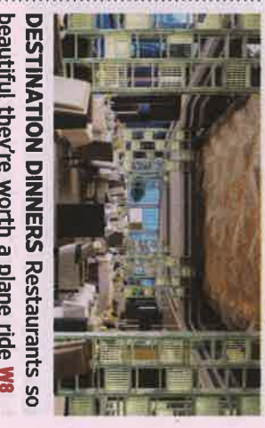
DESTINATION DINNERS Restaurants so beautiful they're worth a plane ride W8