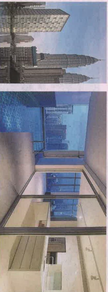
POOL PARTY At ONE KL, a 35-story luxury building in Kuala Lumpur completed in 2009, the building's tagline boasts, 'Apartments, 95 Swimming Pools.'