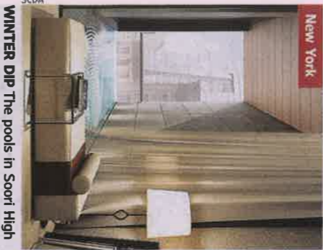
WINTER DIP The pools in Sooty High Line, seen in a rendering here, will be heated to deal with New York's winters.