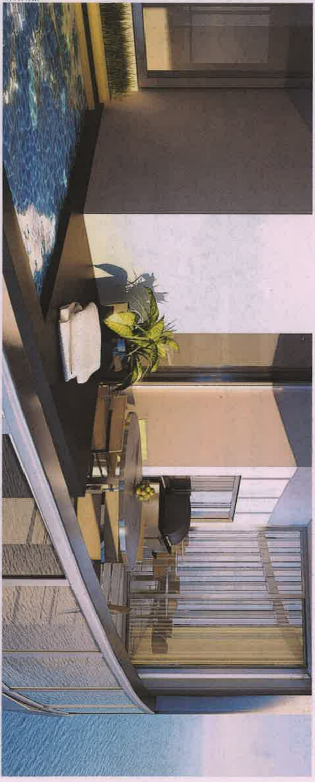
TINY BUBBLES A rendering of a balcony at Florida's Porsche Design Tower. The majority of the building's 132 units have prefabricated pools—made of stainless steel, they include Jacuzzi bubbles and a hydro-massage bench. Unit prices range from $6.3 million to $32.5 million.