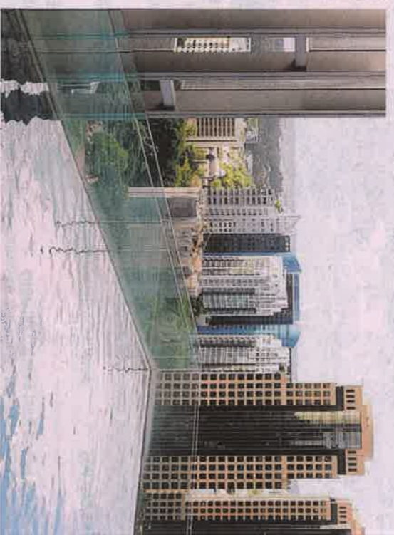
DIVE IN The Marq in Singapore is a two-tower high rise; its Signature Tower of 21 units has individual cantilevered pools sunken below the floor of each unit.