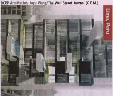
HIGH LIFE A rendering of Sky Condos in Lima, Peru, which will have 10 duplexes and cantilevered pools.